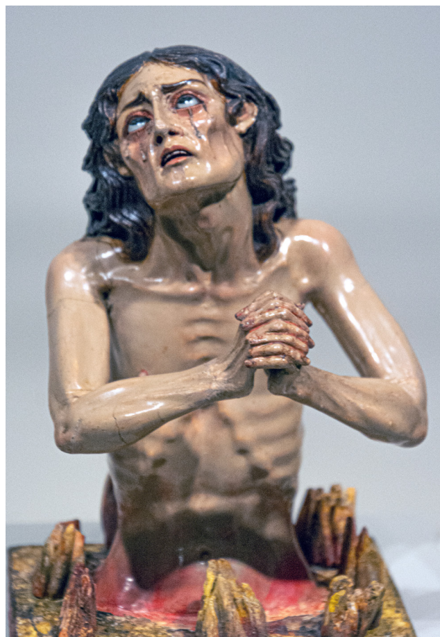
Fig. 01: Soul in Purgatory , attributed to Manuel Chili (Caspicara), ca. 1775 (Hispanic Society of America)

In particular, our sculpture favors a period of activity close-in-execution to these Fates whose sculptural power and spectacle is commensurate. Especially analogous is the treatment of anatomy observed between our Christ and Chili's figure of a Soul in Purgatory (fig. 01), featuring a similarly sculpted upper ribcage, pleated sternum, sunken abdomen, pouched gut and upward gazing expression pervaded by a long straight nose and pursed brow that likewise echo an adoring Magi in his Nativity on the altarpiece Chili made for the Convent of St. Francis in Quito. The outer edges of our Christ's hair, descending in wave-like tufts, are consonant with Chili's figure of a Soul in Heaven and is likewise reflected on his figure of San Joaquín at the Church of San Francisco in Quito. Also notable is the treatment of blood along our figure's back, articulated in uniquely outcropped strokes