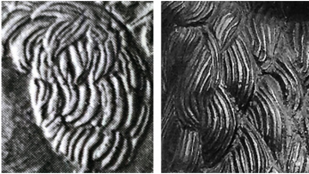
Fig. 04: detail of the 1507 self-portrait medal of Hermann Vischer the Younger (left); detail of a Wild Man, Vischer family workshop, ca. 1510-15 (right)