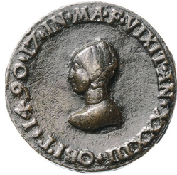
Fig. 08: obverse of a medal of Margaretha Vischer, here attributed to Peter Vischer the Elder, 1490, brass

refers to January or June. Additionally, Fischer was a common alternate spelling for Vischer.