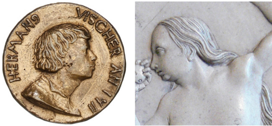
Fig. 05: Self-portrait medal, here attributed to Hermann Vischer the Younger, 1511, brass (Münzkabinett, Berlin) (left); detail of the Temptation of Adam and Eve by Ludwig Krug, 1514, solnhofen stone (Staatliche Museen Preussischer, Berlin-Dahlem)

example of the Wild Man is freer in its patterning of hair, articulated instead with thickly carved striations rendered in an arched pattern (Fig. 04).