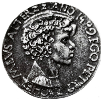
Fig. 01: Self-portrait medal, Peter Vischer the Younger, 1509, brass (Cabinet des Medailles, Bibliotheque Nationale, Paris)

The medals have most commonly been attributed to Peter Vischer the Younger although Hermann the Younger has, at-times, been considered the author of his own portrait medals. 7 The self-portrait of Peter the Younger, who “excelled his father and brother in art,” 8 and whose confident effigy demonstrates a talented hand, is unanimously accepted as a self-portrait and is his earliest known secure work. Its larger scale, higher relief and balanced composition suggest it is the first German medal clearly informed by the influence of Italian medals. 9 The advent of the portrait medal in Italy had already been a component of its artistic culture since the 1430s. 10