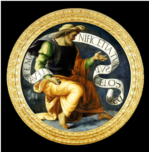
Fig. 03: David tondo , by Pietro Perugino (Musée des Beaux-Arts of Nantes, France)

casts of the Farnese Cup intended for collectors that were produced during this period, possibly accounting for the origin of the bronze casts.